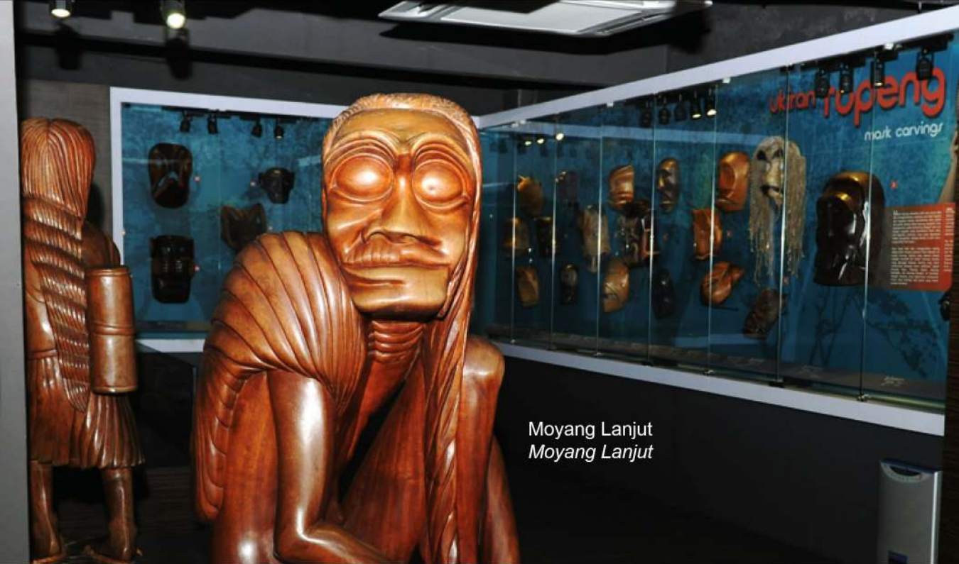
Moyang Lanjut Moyang Lanjut