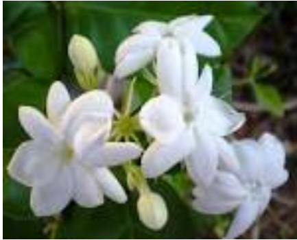
Bunga Kenanga ( Canarium Odoratum )