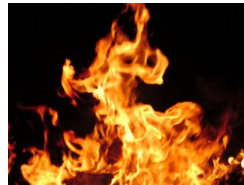
The Ashes of Grain Husk