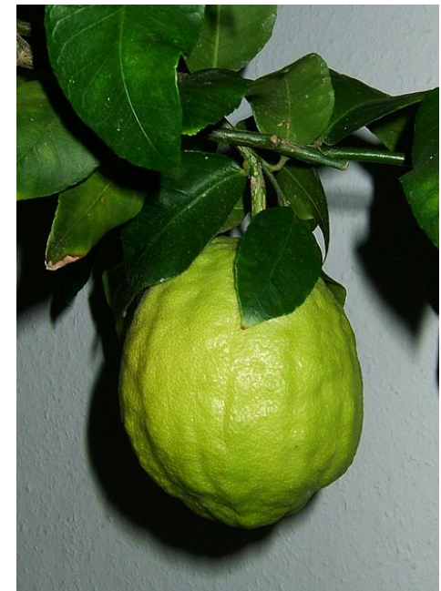
' Asam Kerat Lintang ' ( citrus medica Linn)