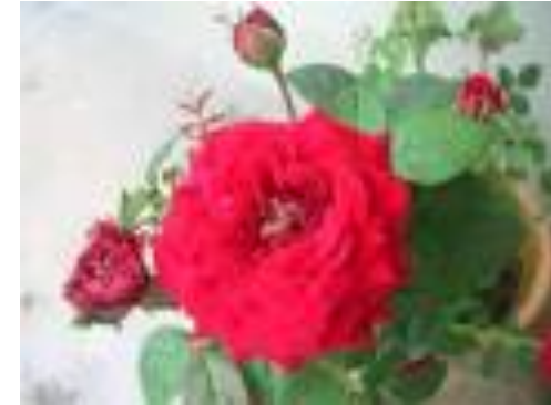
Bunga Mawar /Ros ( Damask Rose )