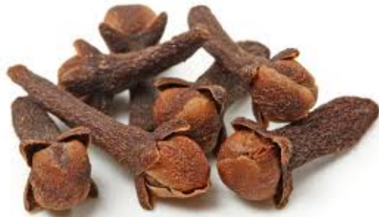
Cloves ( Syzygium Aromaticum )