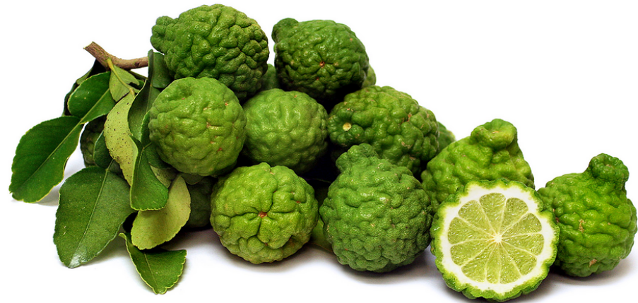
Kaffir lime ( Citrus Hystrix )