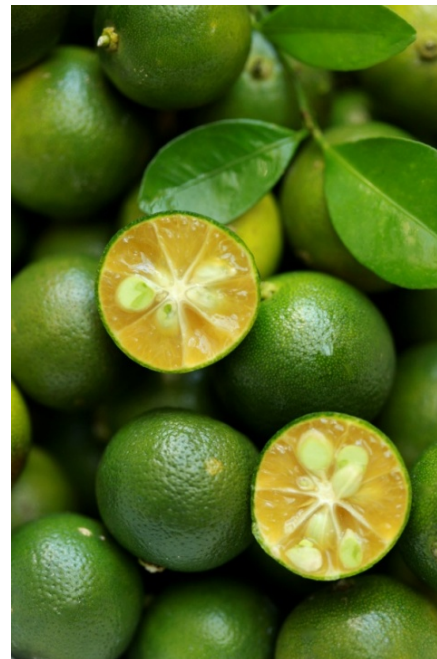
Calamondin ( fortunella japonica )