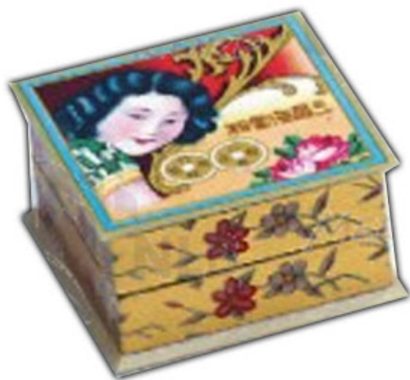
Sam Fong Hoi Tong Face Powder / 'bedak nyonya'